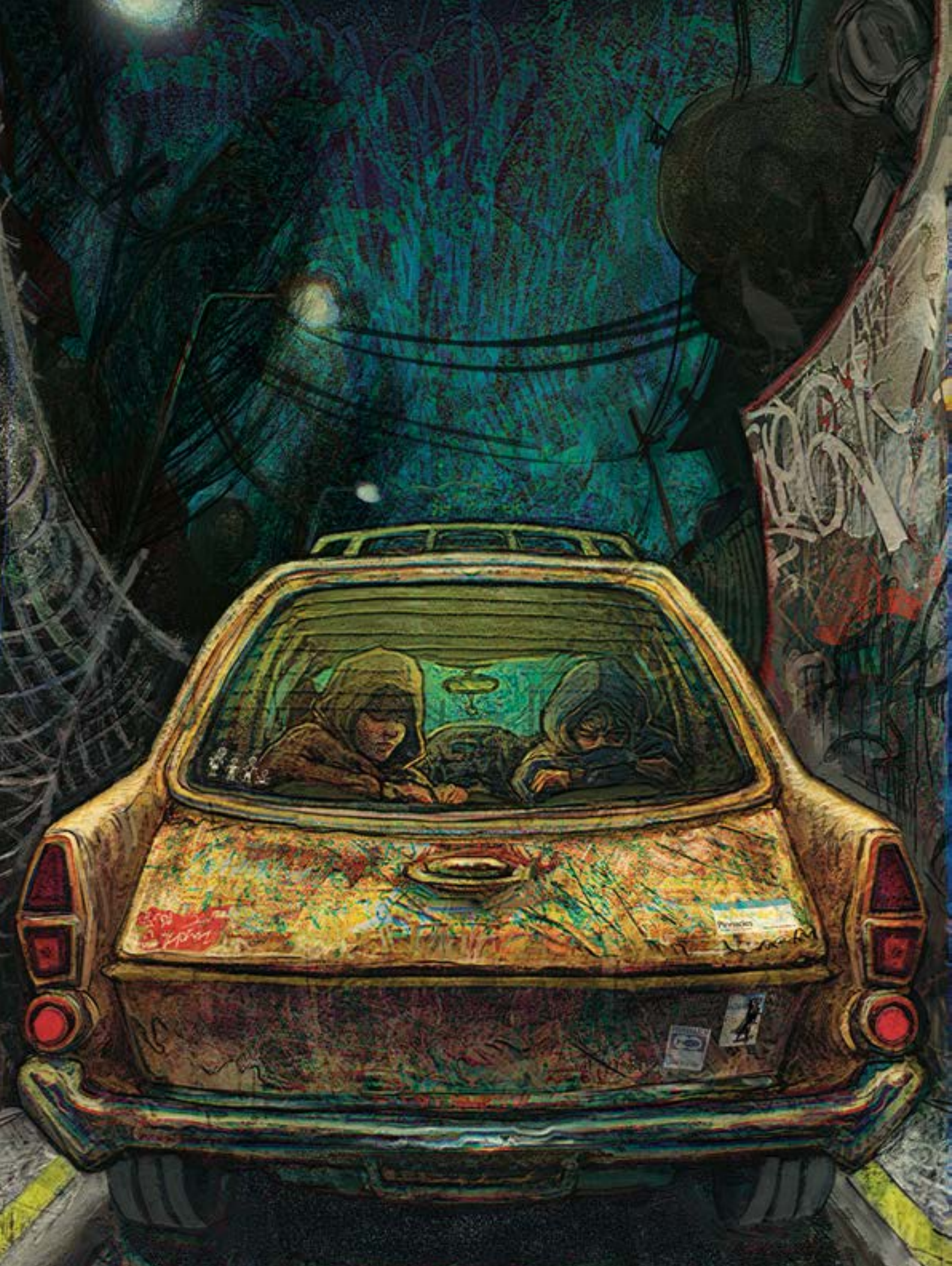
Illustration by Kyro Phoenix Carpenter